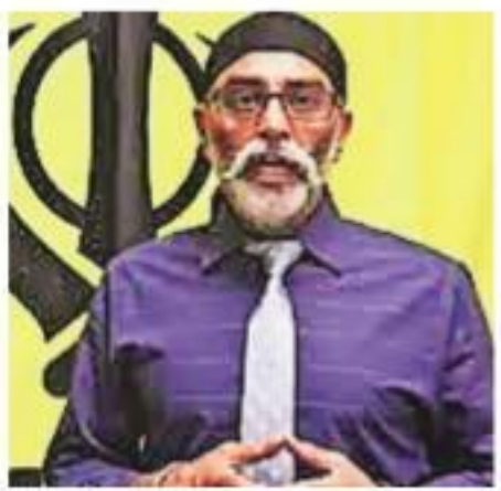
Gurpatwant Singh Pannun, founder of Sikhs For Justice, is a dual citizen of the US and Canada

THE UNITED STATES "thwarted a conspiracy to assassinate" Khalistan separatist Gurpatwant Singh Pannun on American soil and "issued a warning to India's government over concerns it was involved in the plot," the UK-based daily, Financial Times , has reported, citing multiple sources.